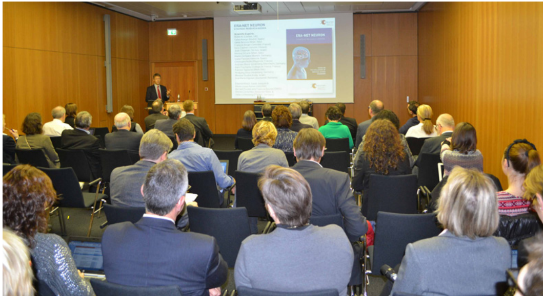
Attending the symposium

The symposium also emphasized the increasing awareness of patient involvement in brain research. Various models were suggested on what is the most appropriate type of patients' participation. For instance, patient organizations can be key partners in clinical trials. There is however a need to educate patients and scientists on why patient involvement in research is necessary and how it can be done. Such efforts should be directed towards the current lack of experience, education and awareness of both patient and lay organizations on the one hand and scientists and clinicians on the other hand. Practical benefits of successful involvement range from patient-friendly information sheets, better recruitment, and better dissemination of research results.