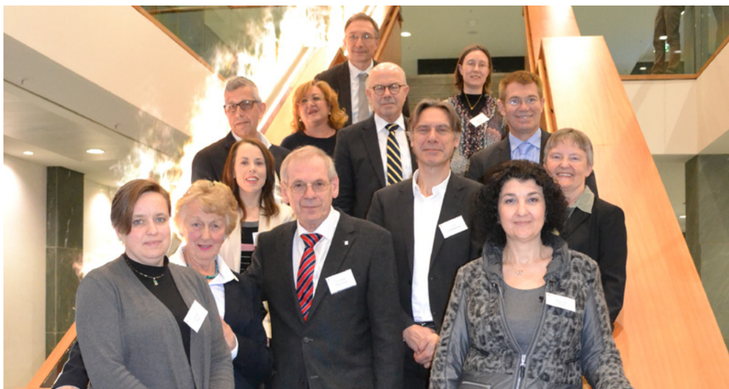
The speakers at the symposium

As it turned out during the following presentations, there is broad agreement that the traditional divisions between the faculties of neurology and psychiatry and clinical and fundamental neuroscience are becoming outdated by the latest research findings. Once the brain and nervous system in their normal function are better understood, it will be easier to unravel their related disorders. Furthermore, since neurological and mental disorders can be conceptualized as disorders of the brain, both psychiatrists and neurologists need comprehensive training and continuing education in neurosciences and in each other's clinical fields. Here lies one of the challenges for universities, research institutions and funding organizations.